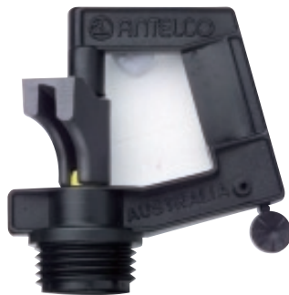
Rotor Rain™ 3/8" Thread