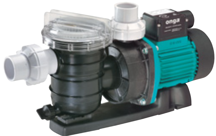
Leisuretime Pool Pump Model LTP550

Ideal for small to medium domestic swimming pools and solar pool heating.