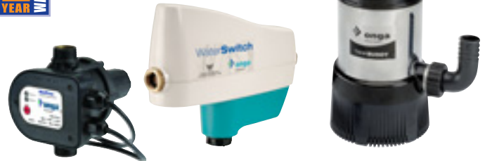
TankBuddy with WaterSwitch Performance