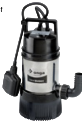
TankBuddy Pump Performance

Treated water pump-out chambers (Septic Systems) Noise sensitive urban rainwater installations