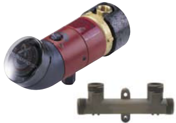
UP15-14 BUT pump with valve kit