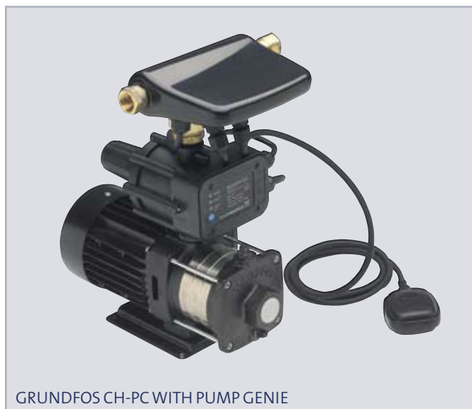
GRUNDFOS CH-PC WITH PUMP GENIE