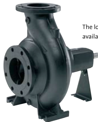
The long-coupled NKG pumps are available as bare-shaft pumps