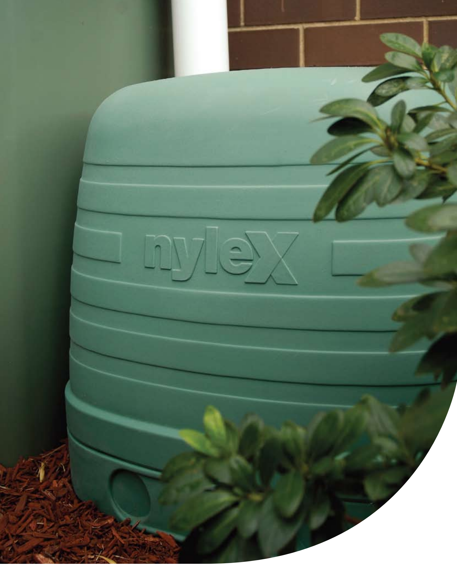
PC3 Rain Tank Pump Cover