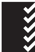
AS2845.1 Lic 1335